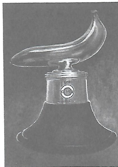
THE C.M.I. BANANA