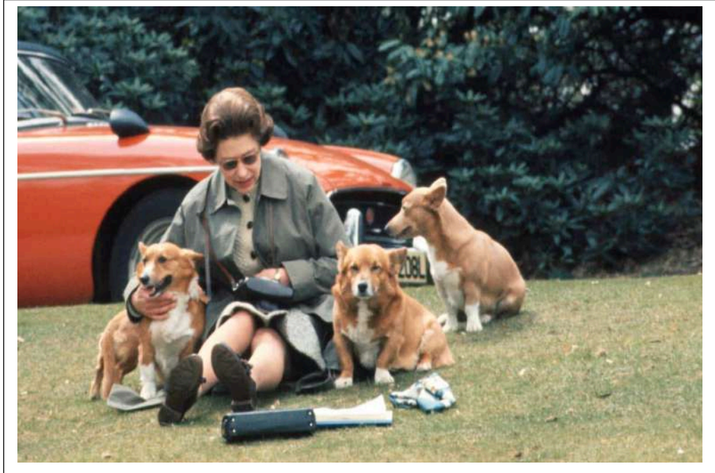
HM The Queen with MGB and Corgis

This quarter has been dominated by the passing of HM Queen Elizabeth II and the Centre marked the sad occasion across its social media sites. Her Majesty has been a constant in our lives for over 70 years and, I am sure, will be sorely missed. Her MG connections were slim but there is a photo of her with her Corgis in front of an MGB in existence which has been widely used in MG circles. Her husband, Prince Philip, was no stranger to MGs having owned a TD in their courting days in which, according to Her Majesty, he drove her far too fast in it. Her son, and now King Charles III, of course is well known for owning an MGC GT which is still in his possession and kept at Sandringham. Of course, many of us will have watched the funeral processions on TV or perhaps in person with the thousands of others in London and Edinburgh and there will have been tears in many eyes at both the grandeur and poignancy of the occasion.