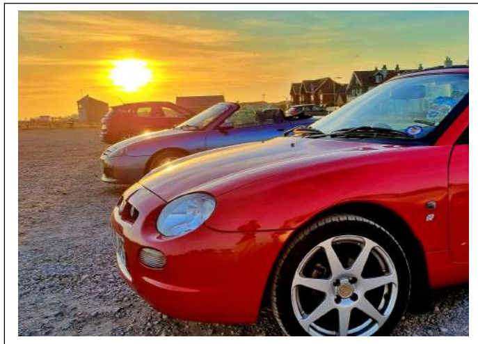
Sunset over Hayling