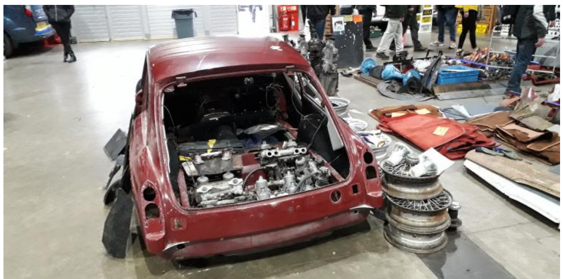
Alternative use for an MGB GT

We had biblical rain coming home so exhausted after the drive but pleased we went! If you get a chance next year go for it.