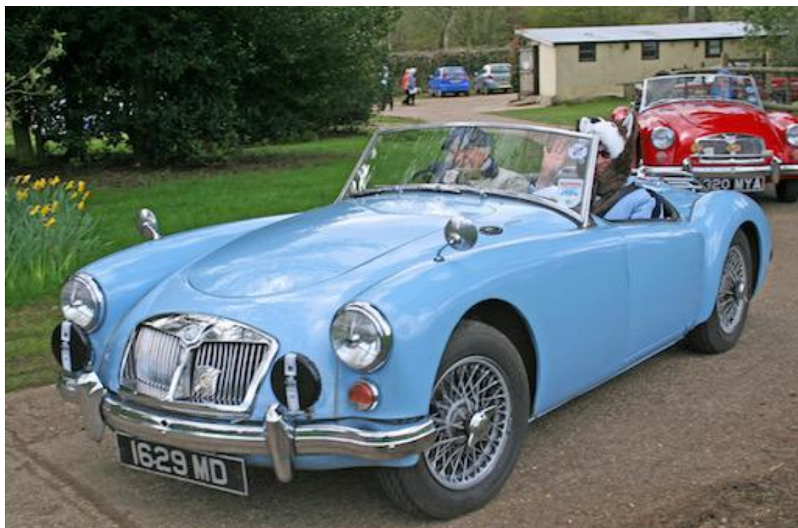
Piers on a run in 2012

Piers will be very much missed in the South East Centre.